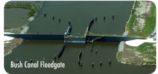
Bush Canal Floodgate

$350 million in local and state funds have been invested to date on the Morganza system, and projects totalling $500 million are in the planning phase.