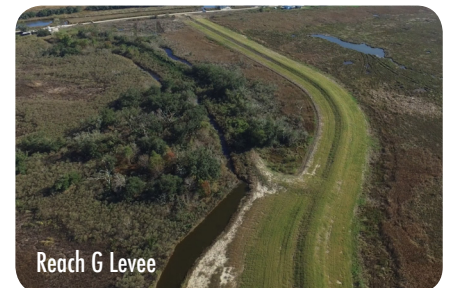
Reach G Levee

Closing the Gap - As of June 2017, approximately 45 miles of levees and floodgates along the Morganza alignment from Dularge to Cut Off are permitted, under construction, or completed - all with only local and state funding.