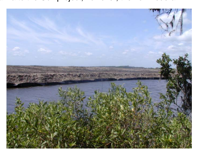
Levee Reach J-1 Construction

Levee Reach J-3, First Lift, under construction