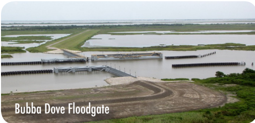
Bubba Dove Floodgate

The Morganza to the Gulf Hurricane Protection System is a 98-mile levee, lock and floodgate system designed to provide 100-year, Category 3 storm protection to 150,000 residents in Terrebonne and Lafourche parishes and 1,700 square miles of wetlands.