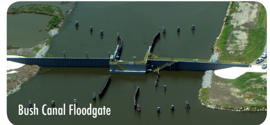
Bush Canal Floodgate

$350 million in local and state funds have been invested to date on the Morganza system, and projects totalling $500 million are in the planning phase.