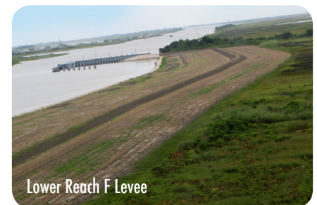
Lower Reach F Levee