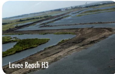
Levee Reach H3